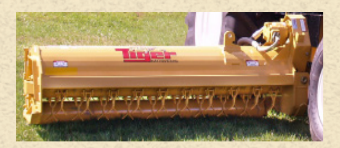
75"side flail with standard cut knives Available in 60", 75" and 90" sizes