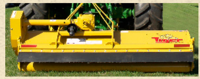
96" rear flail with standard cut knives Available in 75", 90", 96", 102" and 110" sizes