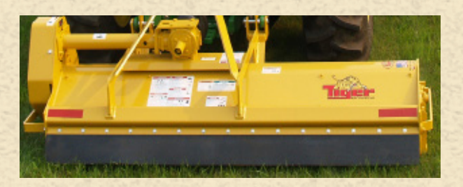
90" Rear flail with standard cut knives Available in 75", 90" and 96" sizes