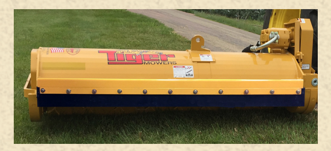
63" Flail with standard cut knives

Tiger takes pride in building a perfectly matched mowing system to go with the tractor of your choice. Experience the super duty series, it is designed to give you a powerful mower with a lighter weight cutting head that gives more stability, matching up perfectly with a 85 to 115 HP utility tractor. The robust 4 3/4" cutting shaft works great for mowing grass and light brush.