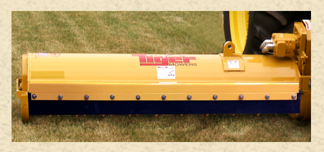
75" Flail with standard cut knives Available in 63"and 75" sizes