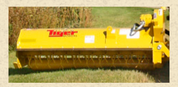
60" side flail with standard cut knives

Explore Tiger's extreme duty mowers, built for heavier use with an extra tough skin along with a large 6" diameter cutting shaft. The increased size and horsepower of a mid ranged tractor (110 to 155HP) is recommended to take full advantage of the extreme duty series.