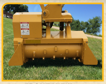
FRONT VIEW OF MULCHING HEAD