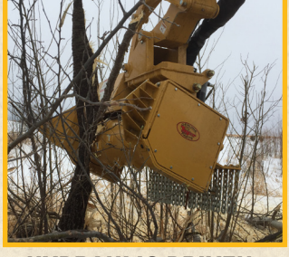
HYDRAULIC DRIVEN HEAD TILT