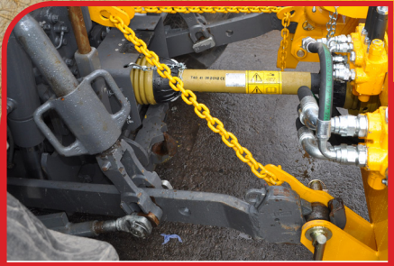
Chain type 3 pt. stabilizers standard on the RBF 130/150 models.