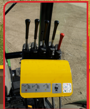
Five lever cable controls