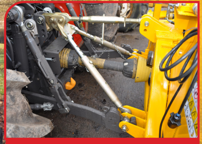
Swing system and a tubular 3 pt. linkage kit standard.