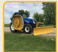
SIDE ROTARY/SNOW PLOW