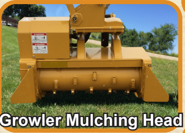
Growler Mulching Head

Ditcher can be mounted to most side mounted mowers.