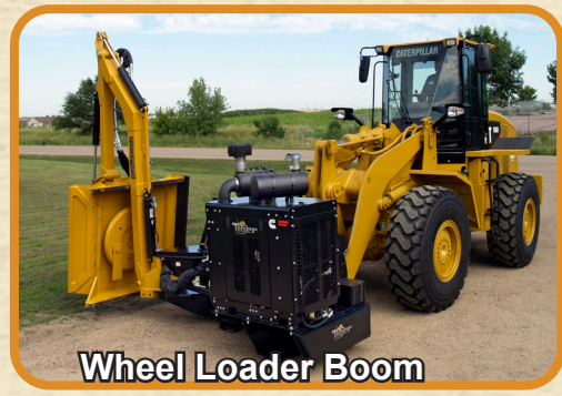
Wheel Loader Boom

Wheel Loader Booms come in several sizes. Easily attaches to front of Wheel Loader.