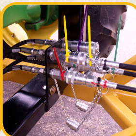
Plug & Play Bulkhead for quick disconnect