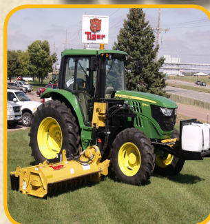
Front mount tank for side flail wetcut system.