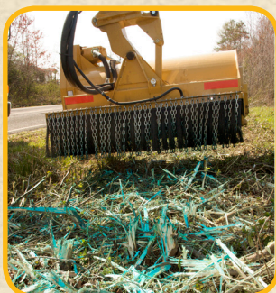
Spray Chamber attaches to Boom Flail Cutter Head.