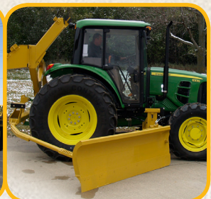
Side Patrol Wing