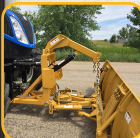
Front Snow Plow

For additional features and specifications, please contact your Tiger Dealer.