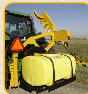
50, 100 & 150 gallon Tank mix systems are available for the tractor 3 point hitch.

The Tiger Wetcut mower attachment is the perfect answer to complete roadside vegetation control. The Tiger Wetcut system gives you the ability to apply selective brush control when the time is right and maximize your control over tough vegetation early on while you are mowing. Wetcut can be added to any Tiger cutter head. Your spray coverage equals width of cut.