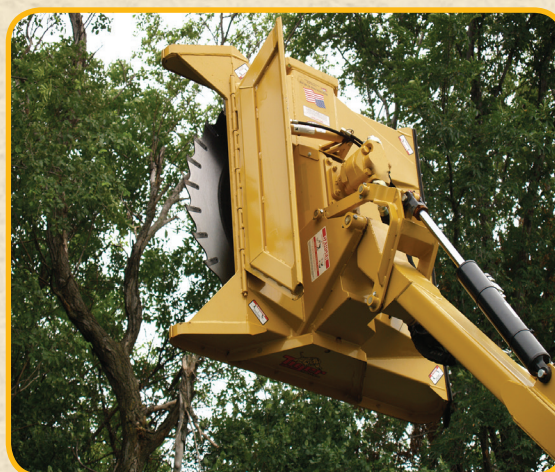
Cut up to 6" tree limbs with Bengal Series Cut up to 8" tree limbs with Saber Series