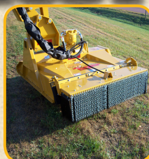
Spray Chamber can also attach to boom Rotary cutter head.