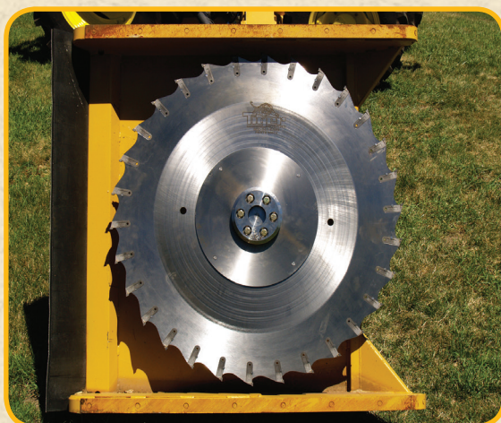
48" Saw Blade Attachment with reinforced center for added blade strength. Tiger Bengal 50" Rotary deck pictured here.

The Tiger 48" Saw Blade Attachment is designed and engineered to provide a smooth cut in trees limbs. This design makes a difference to our customers when aesthetics and thrown material are a concern. The Saw Blade can be mounted on both the Bengal and Saber Series 50" Rotary Cutters. The Saw Blade comes standard with replaceable carbide tipped teeth.