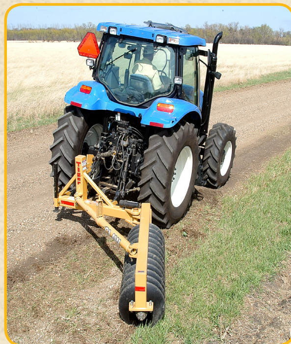
Patented angle design effectively moves and mulches 37" of material.

*U.S. PATENT NO'S 5,108,227 & Re. 34,860 CDN PATENT NO. 2,029,695