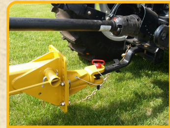
QUICK DISCONNECT DRAWBAR HITCH