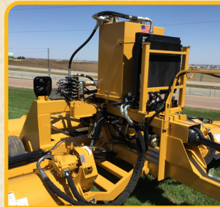
COMPUTERIZED COOLING FAN