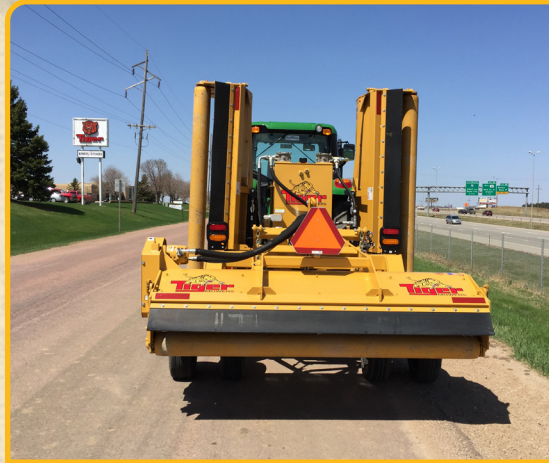
LEGAL WIDTH AND ROAD READY

Extreme duty flail mowers can handle grass and brush up to 1" in diameter and boasts a cut path of over 18'8".