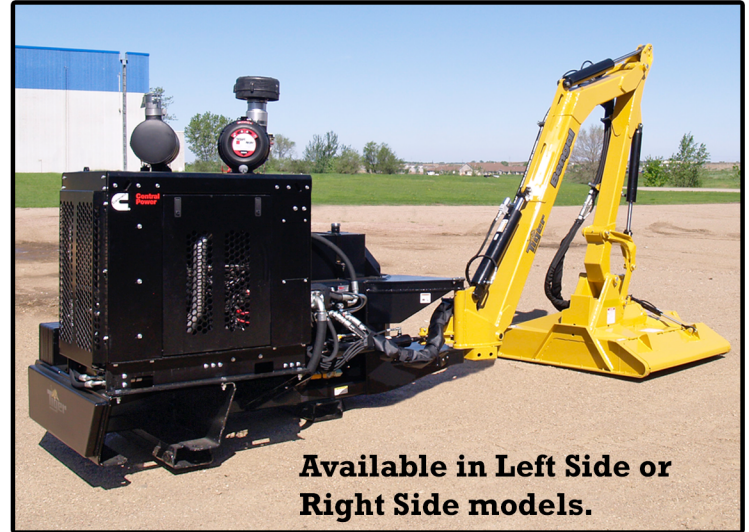
Available in Left Side or Right Side models.