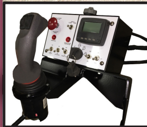
Universal engine control module with Electronic Joystick.